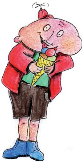
Mondach: Plattolio at een les.