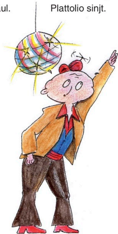
Sinnowent: Plattolio daunzt.