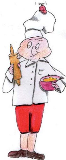
Friedach: Plattolio backt Koke.