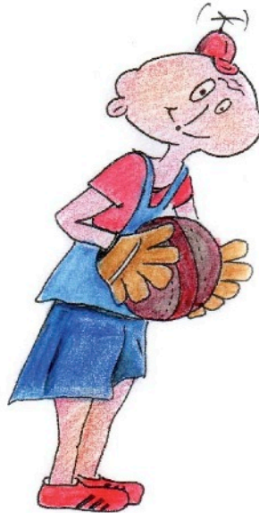
Dinjsdach: Plattolio spelt mettem Baul.