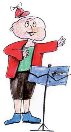
Meddweatj: Plattolio sinjt.