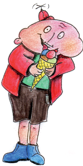
Maandag: Plattolio ett en les.