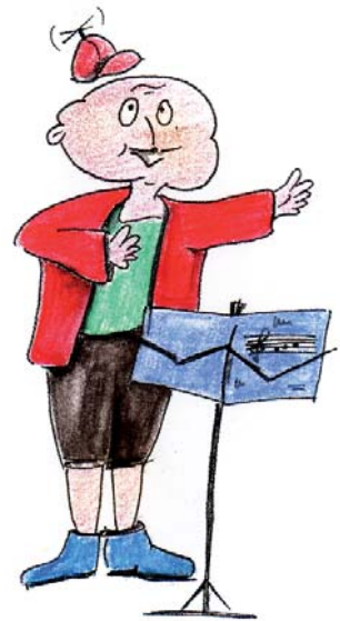
Middeweeek: Plattolio singt.