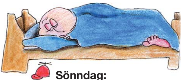
Sönndag: Plattolio slöppt lang.