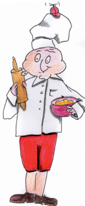
Fredag: Plattolio backt Kook.