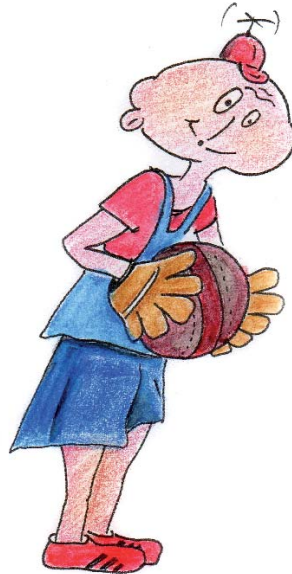
Dingsdag: Plattolio spöolt Ball.