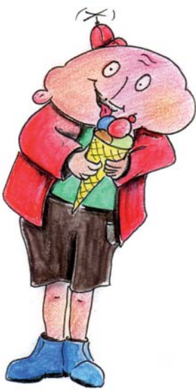
Moondag: Plattolio itt en les.