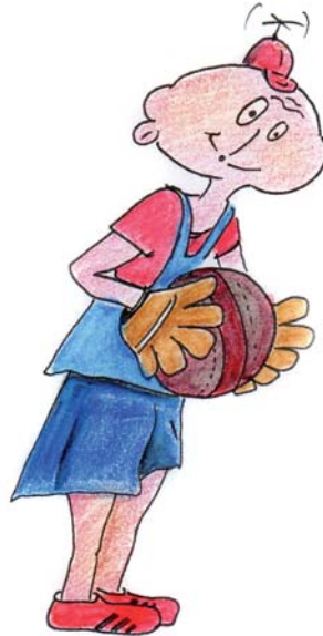
Dingsdag: Plattolio speelt Ball.