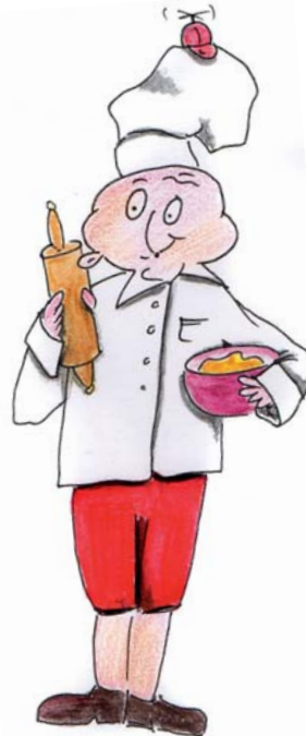
Freedag: Plattolio backt Koken.