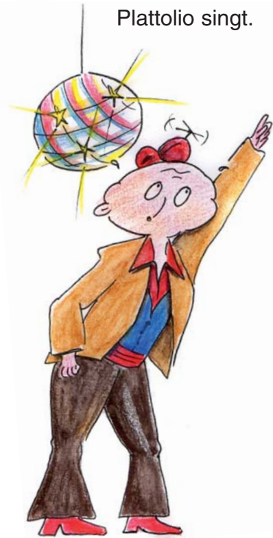
Sünnovend: Plattolio danzt.