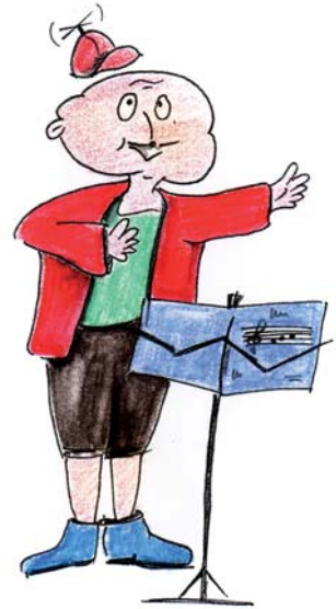
Middeweeken: Plattolio singt.